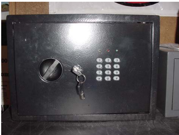
A digital gun safe offers a good balance between speed of access and security for your ready pistol.

There are two forms of storage, which for simplicity's sake we'll call Live Storage and Dead Storage. In live storage, the gun is loaded and accessible to you in a fairly quick manner. This is best accomplished with either a Life Jacket, or a quick access gun safe. Either option allows you to quickly retrieve a loaded handgun, while preventing access by anyone who does not have the key or combination.