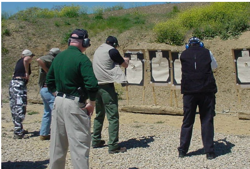
Students shoot in the recent Combative Pistol 2 course near Dallas, Texas