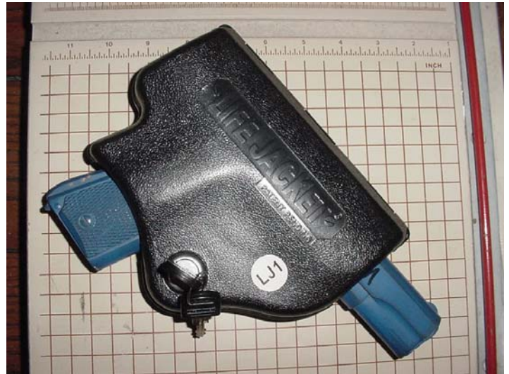
The Life Jacket completely encases the pistol, covering the trigger and other controls safely.

Proper storage of your handgun when you are not wearing it is a critical issue. Whether an inquisitive child, a depressed teenager, or a stupid brother in law, there are people in your immediate circle who must not be allowed access to your guns. On the other hand, you need access to your sidearm, even when at home. Last year in Memphis there were over 5,000 burglaries of occupied homes, and several of our students have been forced to shoot intruders inside their homes. That's hard to do if you can't get to your pistol quickly.