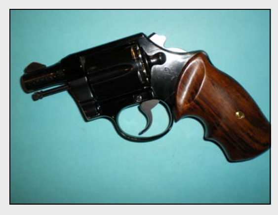
This is one of Tom's favorite BUG's, a 1960 vintage Cobra done up by Grant.

www.grantcunningham.com) is a revolver aficionado and one of the biggest proponents of the wheel-gun as a defensive weapon. If you have a Colt or Smith & Wesson revolver you'd like to have optimized for carry/self defense, check him out.