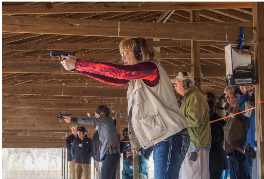
Tactical Conference Ladies' Shoot-Off, 2018 (above)