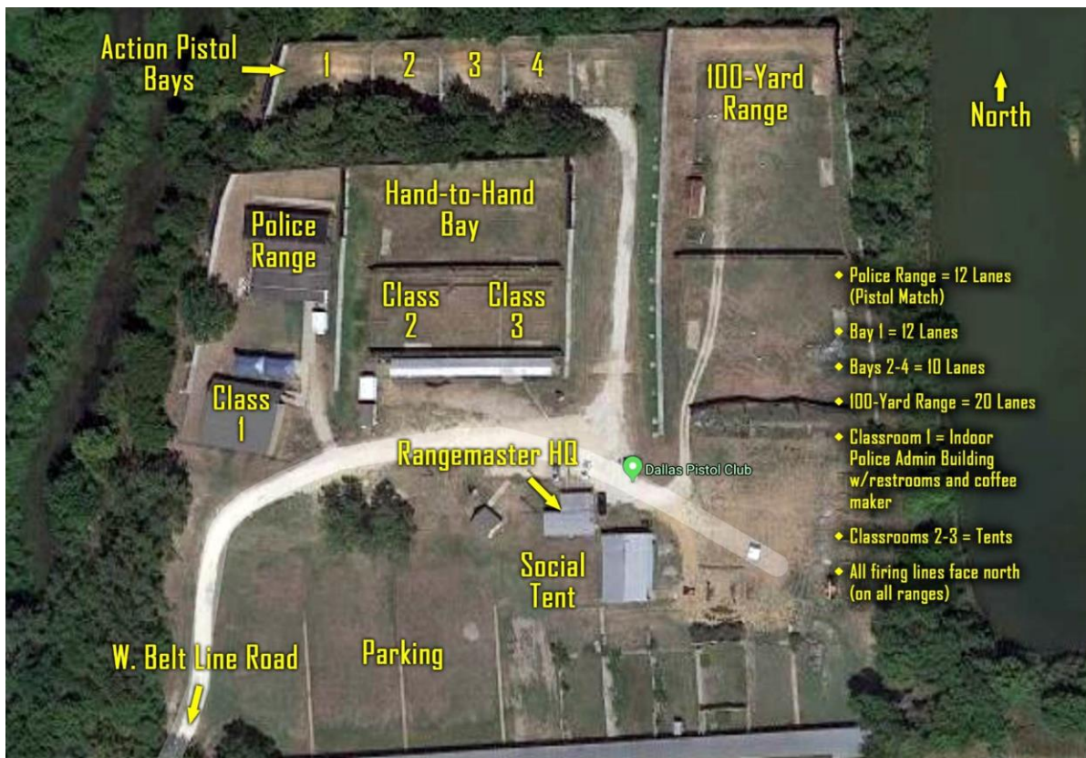
Dallas Pistol Club, host location, Tac Con 2021